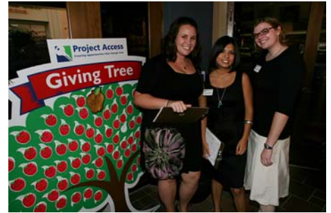
Project Access staff work hard to sell apples from the Giving Tree!