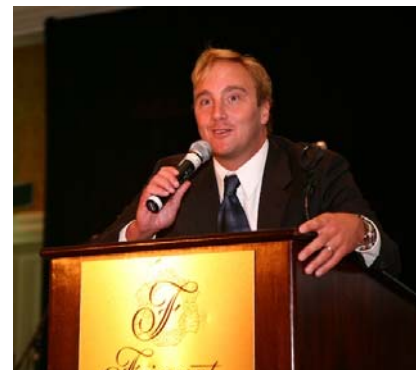
Event host, Jay Mohr begins the Live Auction.