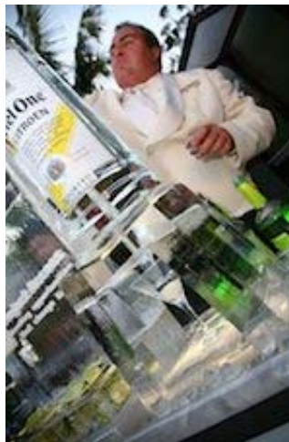
Ketel One again provided their signature Ice Bar